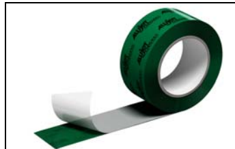
Fig. 1: ALUJET Alusan